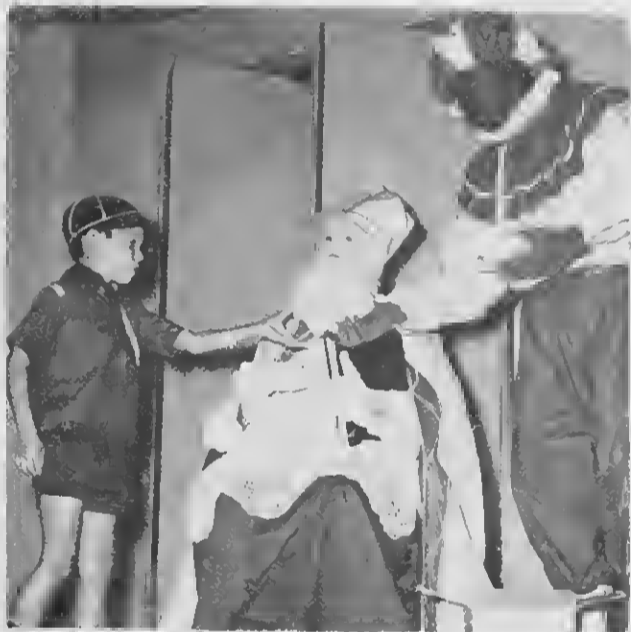
UNO DI e bon muchanan, un Welp, ta recibí su regalo for di Zwarte Piet (drecht).